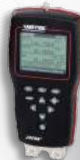
HPC500 HPC502 HPC600

When combined with these JOFRA calibrators, the APM is a powerful calibration tool.