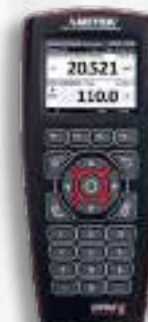
ASC300 ASC301 ASC321 ASC-400 ASC-400 BARO ASC-400 BARO