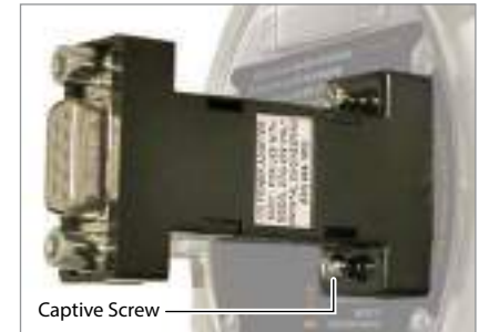
Figure 1. DB9 captive screws

To protect the XP2i from power supply failures, or connection of non-approved DC power supplies, the pass-through connector includes a non-serviceable fuse.