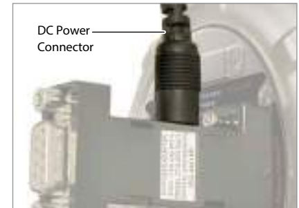
Figure 2. DC power connector to receptacle on DB9 connector