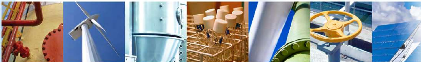
The ASM Series and mAcal.

T he ASC-400 is our latest multifunction process calibrator, which includes an easy-to-use, advanced simplicity user interface. Read and source RTD, thermocouple, current, voltage, frequency, and resistance to calibrate or verify your process sensors. Or, combine with the APM CPF pressure modules to calibrate pressure, or a dry-block to calibrate temperature.