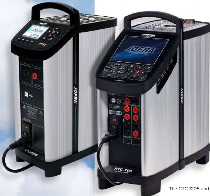
The CTC-1205 and RTC-700.

Our JOFRA dry-block temperature calibrators are the fastest solution available for accurately calibrating temperature. One high speed calibrator reduces test time while also offering automated, hands-off operation, allowing a technician to complete multiple tasks simultaneously. We even have a model that only requires calibration once every three years!