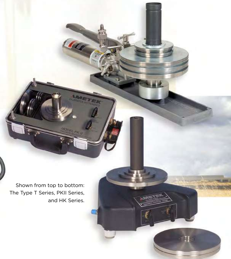
Shown from top to bottom: The Type T Series, PKII Series, and HK Series.