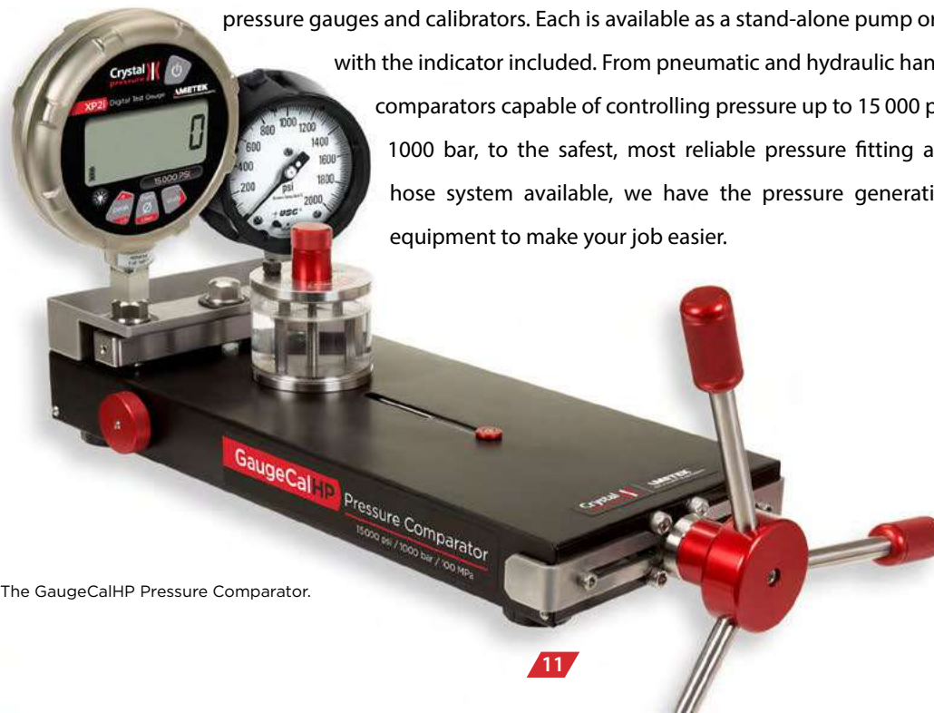
The GaugeCalHP Pressure Comparator.

O ur pressure hand pumps, comparators, and fittings & hoses are the perfect complement to our popular pressure gauges and calibrators. Each is available as a stand-alone pump or part of a complete system with the indicator included. From pneumatic and hydraulic hand pumps, to pressure comparators capable of controlling pressure up to 15 000 psi / 1000 bar, to the safest, most reliable pressure fitting and hose system available, we have the pressure generation equipment to make your job easier.