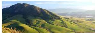
San Luis Obispo, CA USA Crystal Engineering

Combined with our software engineering and research office in India, our various sales and service centers, and over 150 distributors around the globe, our world-wide presence allows us to provide outstanding service no matter where you are!