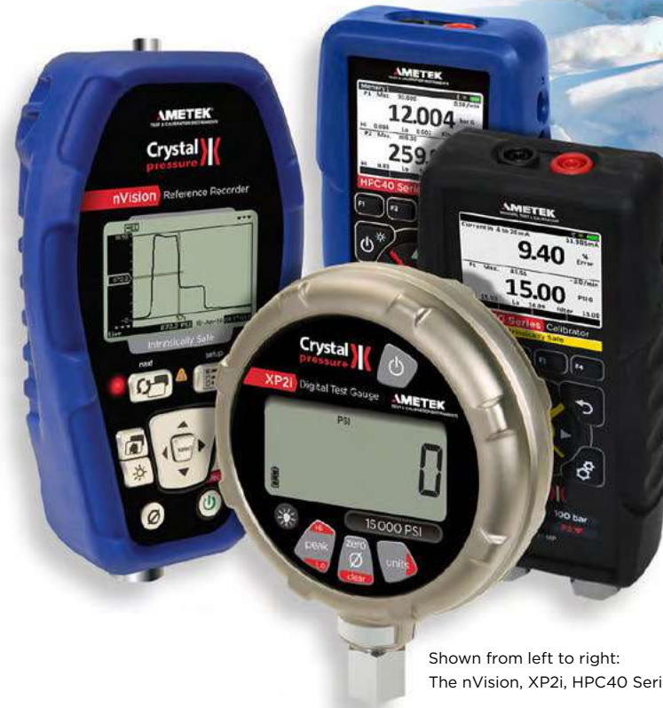
Shown from left to right: The nVision, XP2i, HPC40 Series, and HPC50 Series.

One Crystal pressure product often does the work of three to five devices from other manufacturers — replacing your data logger, your chart recorder, multiple test gauges, and even a dead-weight tester with a single device.