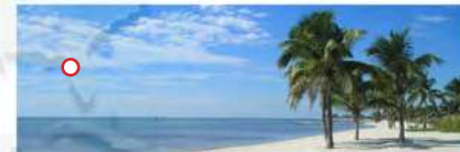
Largo, FL USA Mansfield and Green

M&G designs and manufactures a variety of deadweight testers, hand-pumps, and comparators, for field and lab use from our ISO 9001 certified facility.