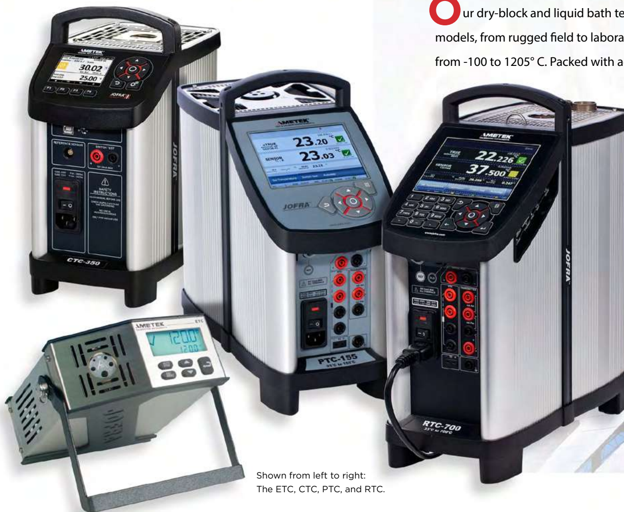
Shown from left to right: The ETC, CTC, PTC, and RTC.